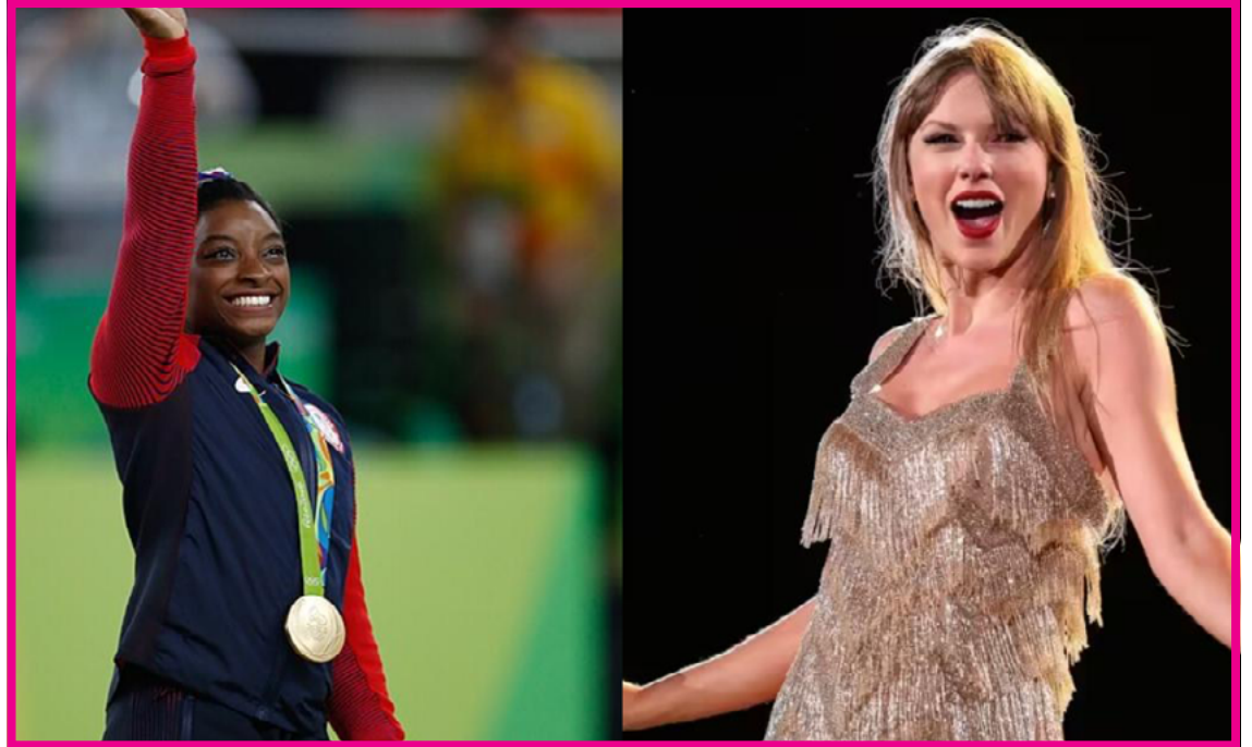
(Simone Biles Taylor Swift)