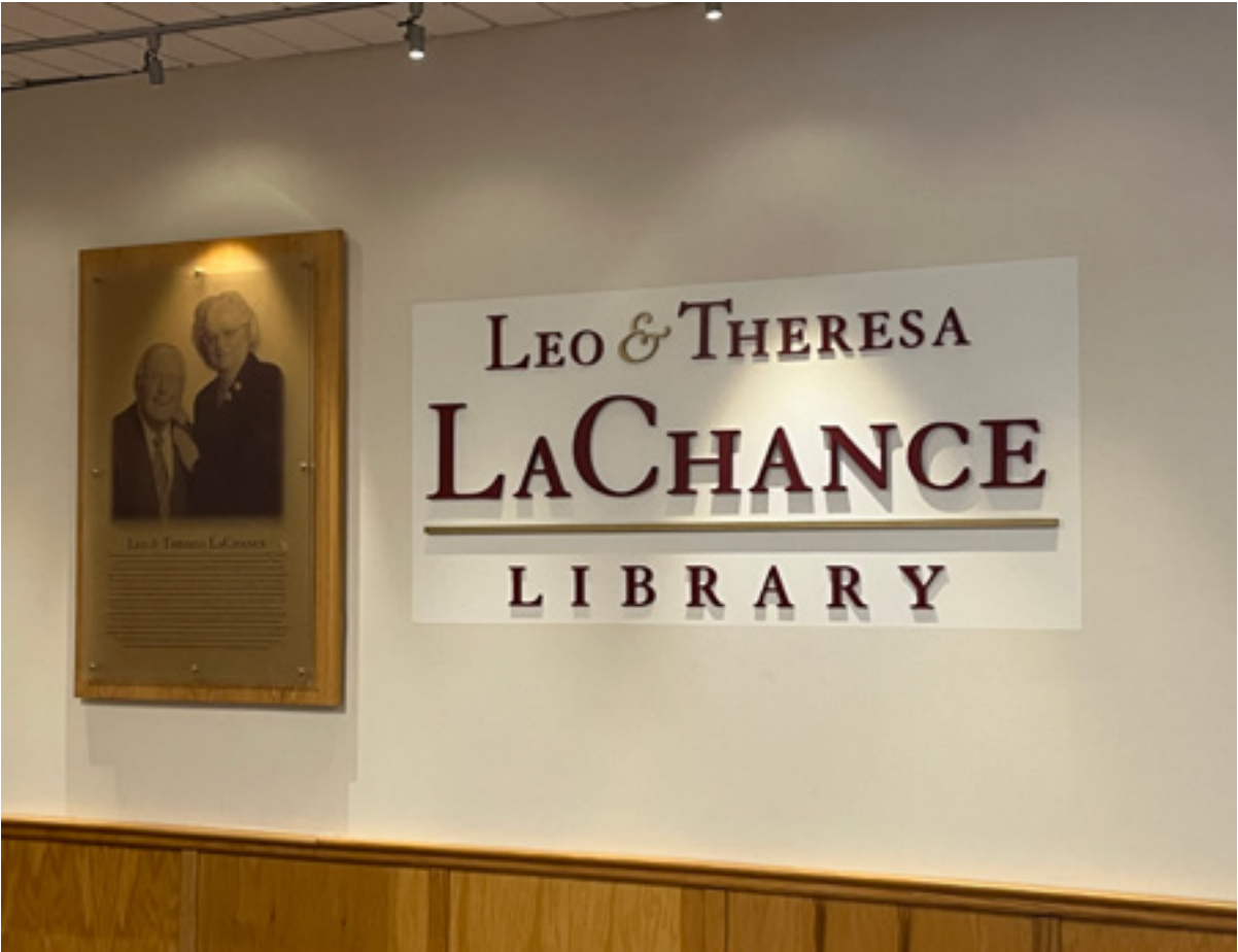
The Leo & Theresa LaChance Library on the Gardner campus