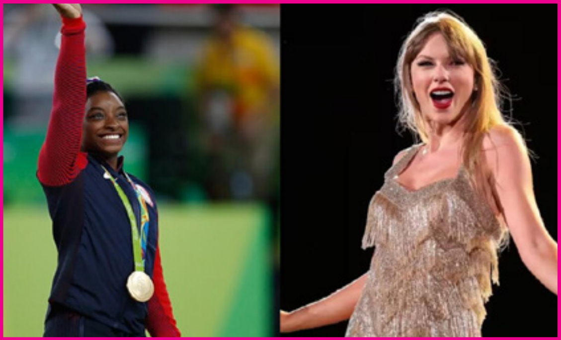
(Simone Biles Taylor Swift)

–Anonymous, Business Administration major